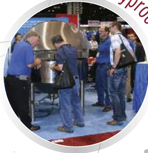
Exhibit Booth Rates